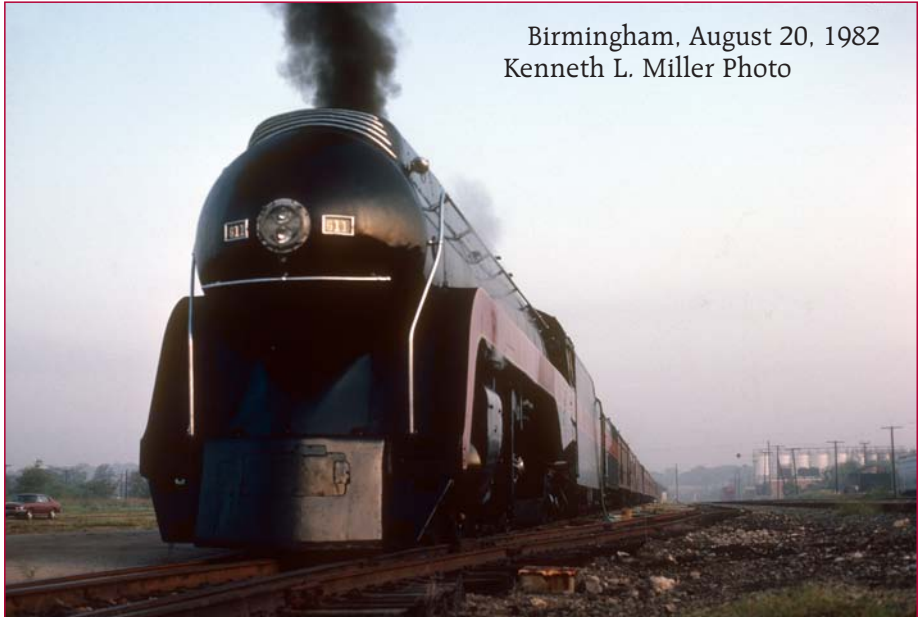
Birmingham, August 20, 1982

As dawn broke, I captured the 611 and train, is there a bad angle on the J?